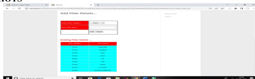
fig.6.1.add filter details and existing filter details