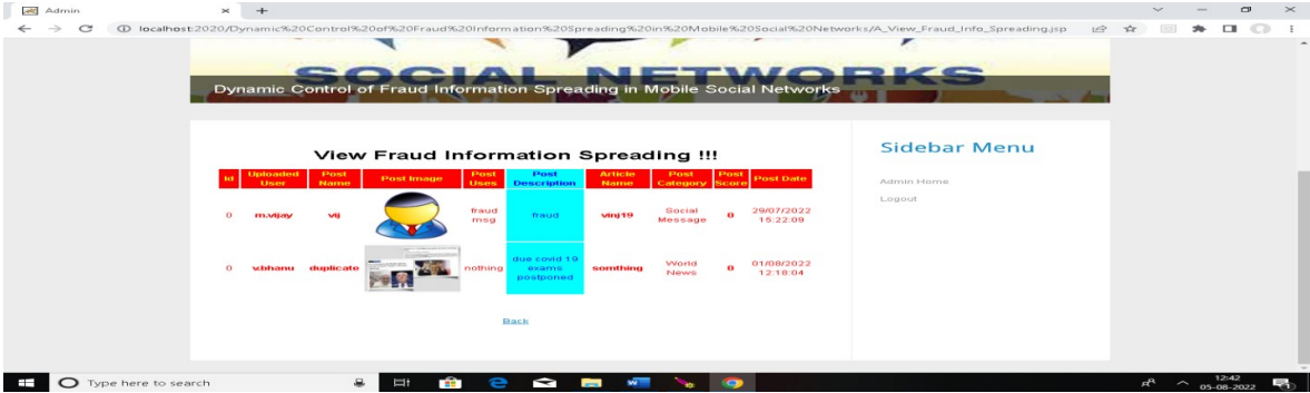
Fig 6.3.view fraud information spreading