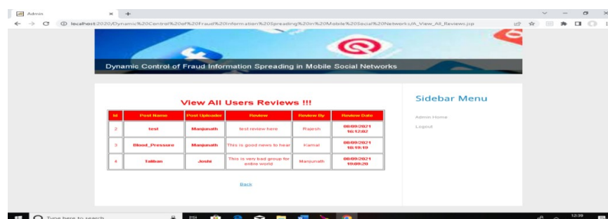
Fig.6.2.view all user reviews.