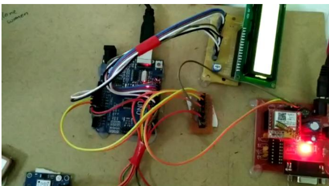
Fig-2: Hardware set up of system.

Fig 2. Shows the hardware setup of system and fig 3. Shows the tracking location when user pressed the key that shows the final result.