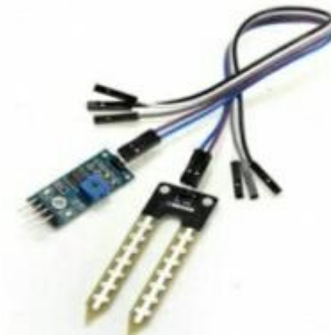
Figure 3. Soil Moisture Sensor