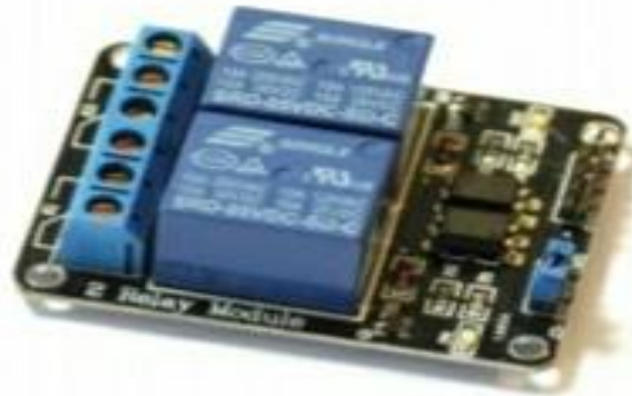
Figure 2. Relay

The relay is an electrical main voltage switch. It can be turn on and off at times of require. There are many types of modules like two, four and eight chambers. The relay is able to handle high power when required to control electric motor or other loads called contractors. sometimes coils are used to protect electric circuits from overloads. In relation of main voltages, the relay has three main connections like a normal pin, closed pin and normal pin. There will be no contact between normal pin and normally open pin. There is a connection between common pin and closed pin. The connection is must and should between common pin and closed pin even whether the relay switch is in off condition. When we on the relay, the circuit opens and there will be no power supply to the load. The GND of the relay goes to ground. IN 1relay port connected to the arduino digital pic and check the first channel of the relay.